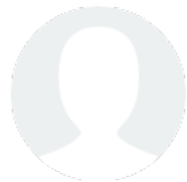
Darren Coaction Real Estate, LLC