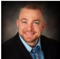
Steven Adashun Jones, Inc.