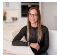
Jodi Adashun Jones, Inc.