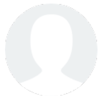
Thomas First Weber, Inc.