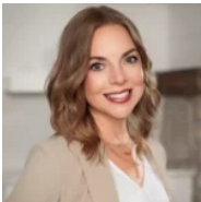
Michelle Adashun Jones, Inc.