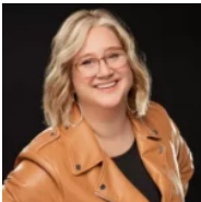
Laura Adashun Jones, Inc.