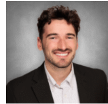
Ben Adashun Jones, Inc.