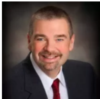
Terrance Adashun Jones, Inc.