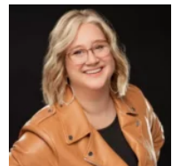
Laura Adashun Jones, Inc.