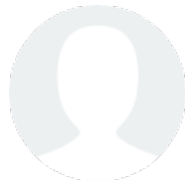
Jasmine Acre Realty, Ltd.