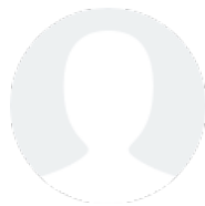
Stacey Acre Realty, Ltd.