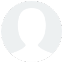
John Expert Real Estate Partners, LLC