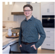
Glenn Adashun Jones, Inc.

Say hello to this nicely kept ranch home with an updated kitchen, 2.5 car garage, newly stained patio, located near North Fond du Lac school district. Come check it out before it's too late!!! Showings start July 5th.