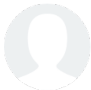
Sage Adashun Jones, Inc.