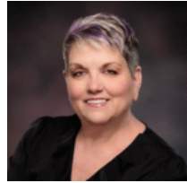
Maigon Adashun Jones, Inc.