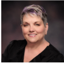
Maigon Adashun Jones, Inc.