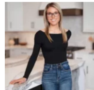
Jada Adashun Jones, Inc.