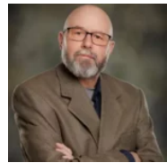
Joe Adashun Jones, Inc.