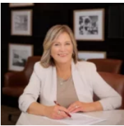
Jan Adashun Jones, Inc.