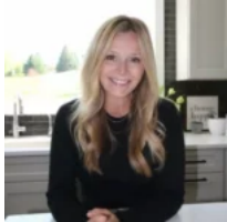
Kelly Adashun Jones, Inc.