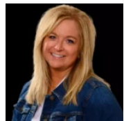
Colette Adashun Jones, Inc.