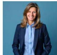
Gail Adashun Jones, Inc.

LOWER LEVEL = Stubbed For Bathroom. Brand New and Ready to Move Into! You will love this open concept, contemporary ranch home! Home features 3 bedrooms, 2 full baths and main floor laundry. Builder will include 2 year warranty, all sidewalks, driveway and approach, patio and walkway to your new front door. Take the stress...