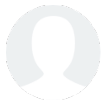
Rachel Ruesch Realty