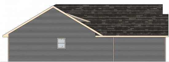
RIGHT ELEVATION SCALE: 3/4" = 1'-0"