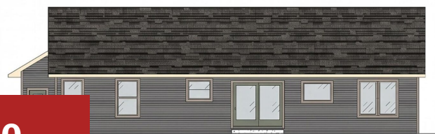
REAR ELEVATION SCALE: 3/4" = 1'-0"