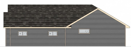
LEFT ELEVATION SCALE: 3/4" = 1'-0"