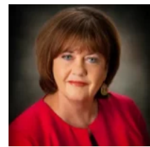
Vickie Adashun Jones, Inc.