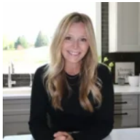
Kelly Adashun Jones, Inc.