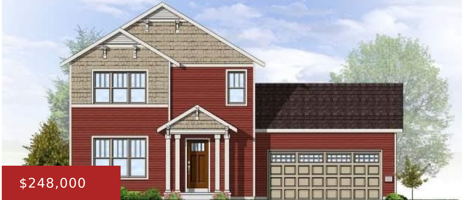
REPRESENTATIVE MODEL FOR COMPARISON

14 Hickory Nut Court, Madison, WI, 53538