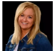
Colette Adashun Jones, Inc.