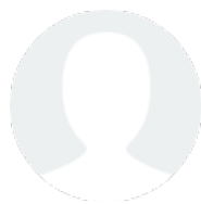
Christine First Weber, Inc.