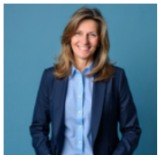
Gail Adashun Jones, Inc.