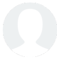
Katrina Resource One Realty, LLC