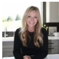
Kelly Adashun Jones, Inc.