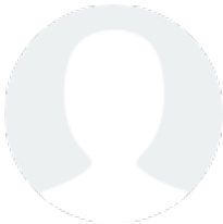
Karen New Home Real Estate, LLC