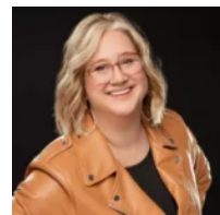
Laura Adashun Jones, Inc.