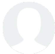
Rana LPT Realty