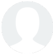
Tony Atlas Group