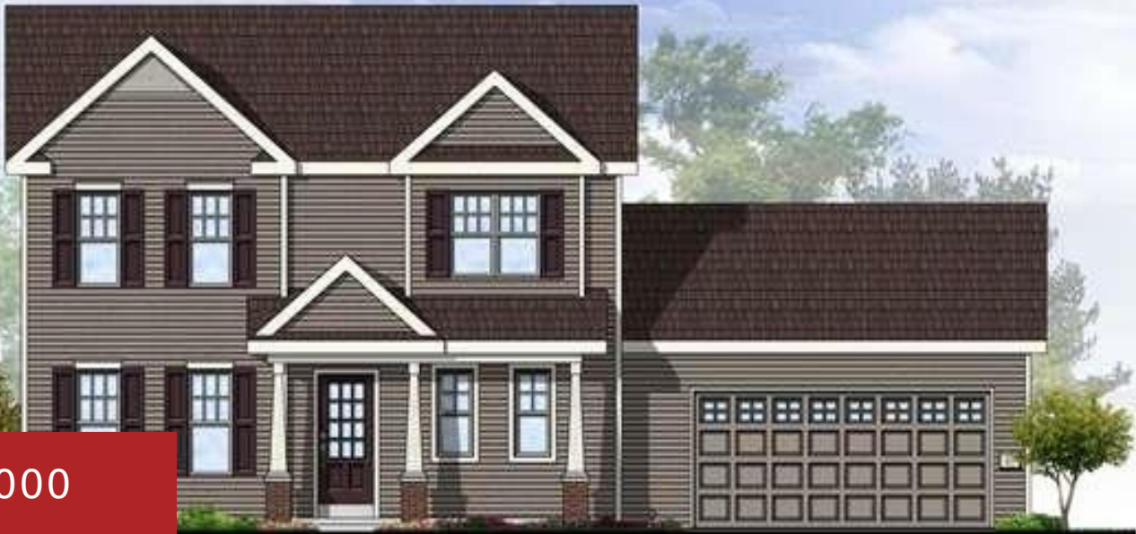
REPRESENTATIVE MODEL FOR COMPARISON

1324 Brown Bear Way, Sun Prairie, WI, 53590