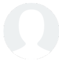
Kevin Adashun Jones, Inc.