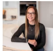
Jodi Adashun Jones, Inc.