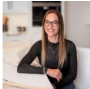
Jodi Adashun Jones, Inc.