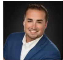
Kevin Adashun Jones, Inc.