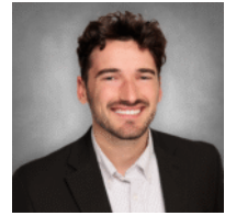
Ben Adashun Jones, Inc.