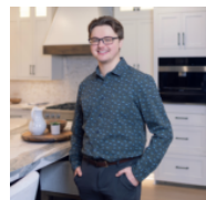
Glenn Adashun Jones, Inc.