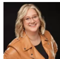
Laura Adashun Jones, Inc.