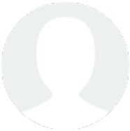
Brooke Roberts Homes and Real Estate