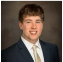
Garrett Adashun Jones, Inc.