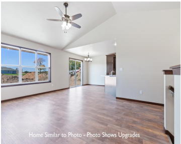
Home Similar to Photo - Photo Shows Upgrades