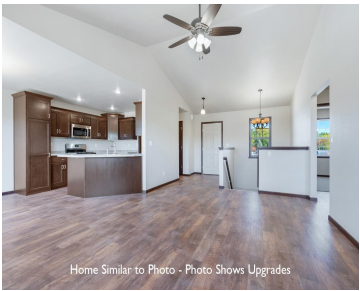
Home Similar to Photo - Photo Shows Upgrades