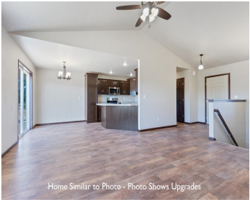
Home Similar to Photo - Photo Shows Upgrades