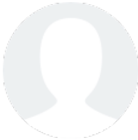
David Ruesch Realty