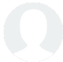
Peggy Roberts Homes and Real Estate