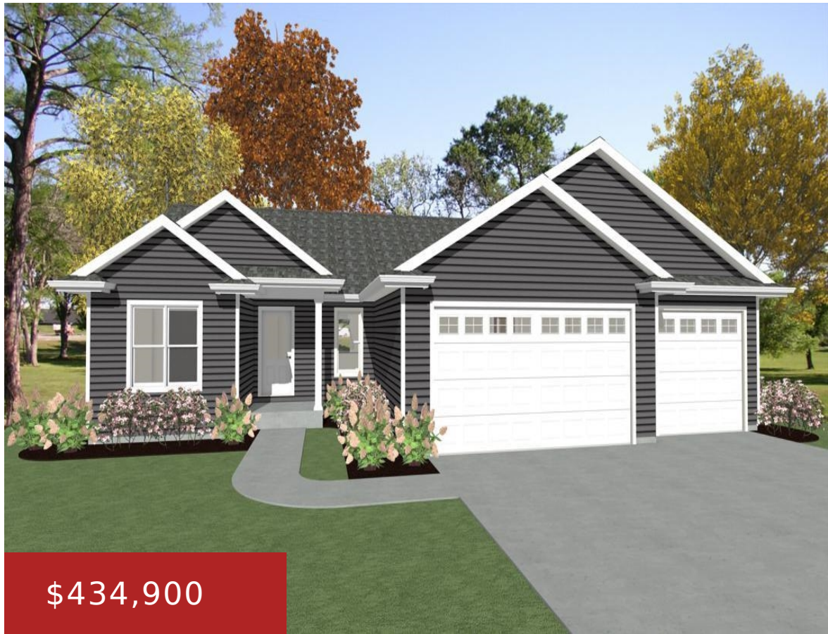
THE JACKSON 3 car option By Van's Realty and Construction of Appleton, Inc