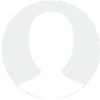
Robin First Weber, Inc.