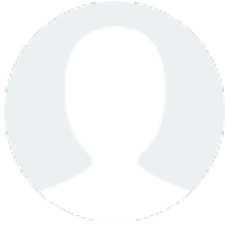
Thomas First Weber, Inc.