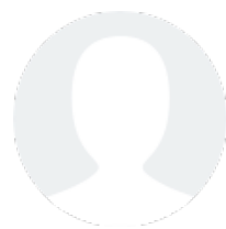
Tyler Beckman Properties