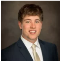
Garrett Adashun Jones, Inc.