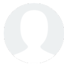
Jorge Beckman Properties