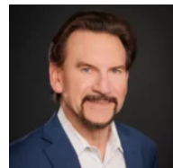
Frank Adashun Jones, Inc.