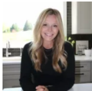
Kelly Adashun Jones, Inc.

As soon as you walk in you will feel at home. 4 bedrooms, 1 full bath, lg kitchen with dining area great living room, and much more for this low price.